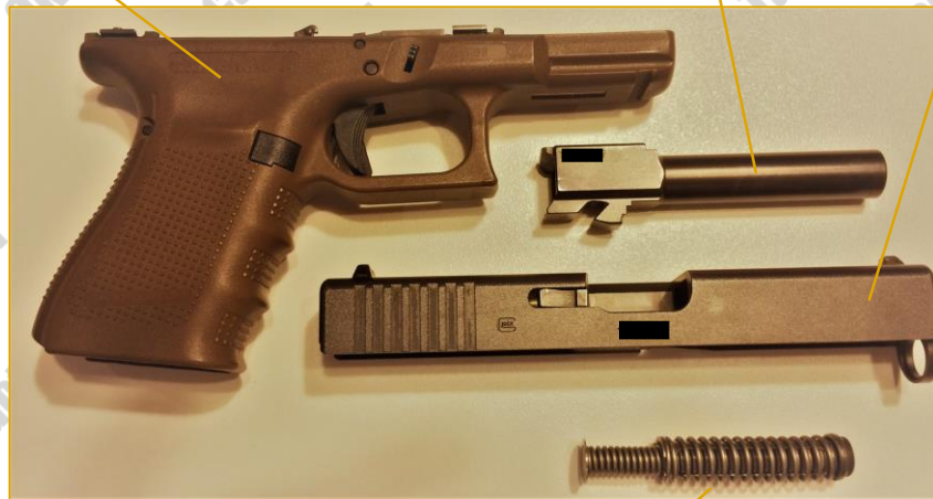
Safety Plunger Recoil Spring Assembly Slide Rails Striker