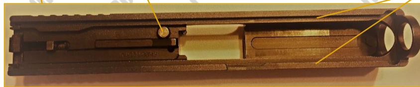
Ejector Slide Stop Slide Guides